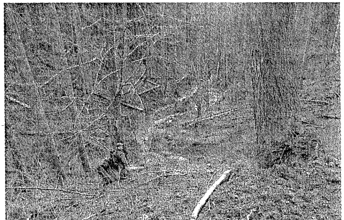
Road-caused landslide, Clatsop State Forest, Dec. 2008