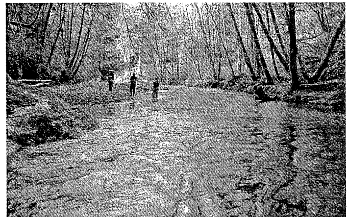
The beautiful Kilchis River, October 2008.